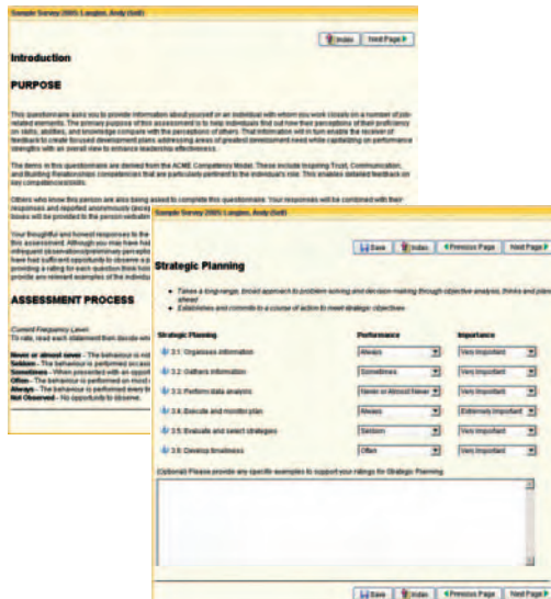
Clear on-screen instructions and straightforward navigation ensure that surveys are easy to complete

With Survey, you'll not only save time - you'll gain a much better understanding of the skills, needs and motivation of your people.